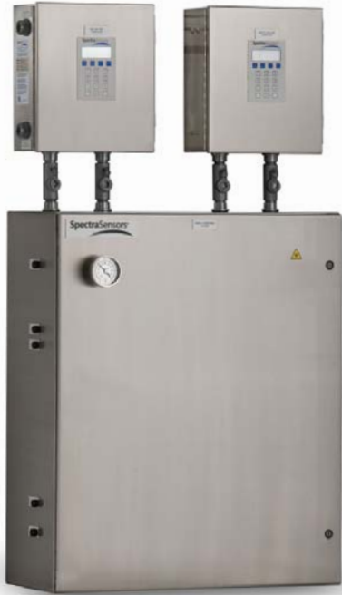
3-Pack Analyzer System with Heated Sample Conditioning and Pressure Regulation

Training requirements are reduced and the system enables fewer electrical runs, fewer sample runs and less labor. Installation and operational costs are dramatically reduced.